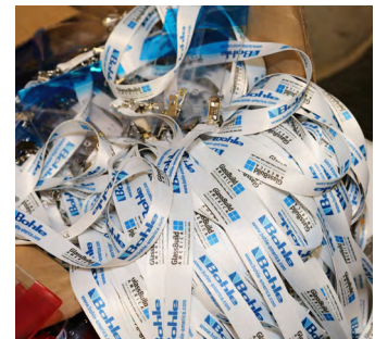
Sponsor responsible for producing lanyards and shipping to show site.