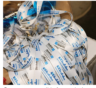
Sponsor responsible for producing lanyards and shipping to show site.